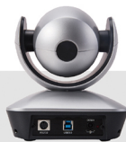
Back of Meet 5